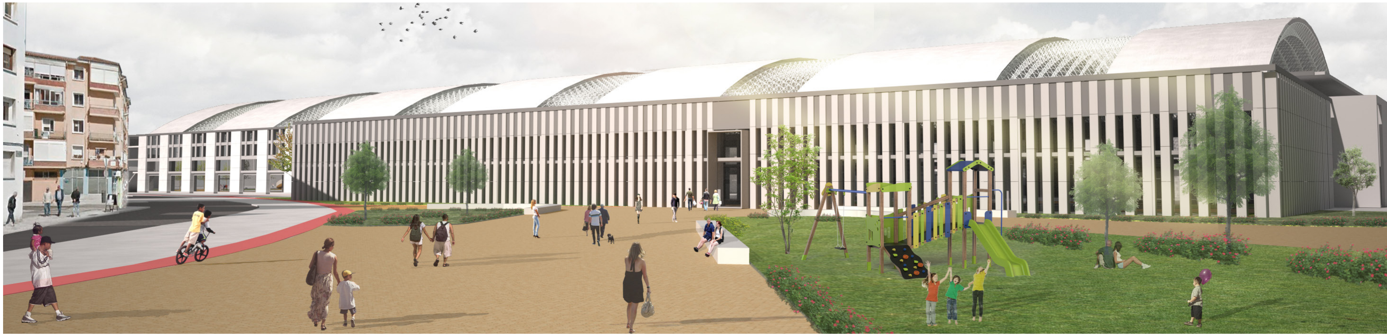
FLOORS AND PLANS E: 1/1000